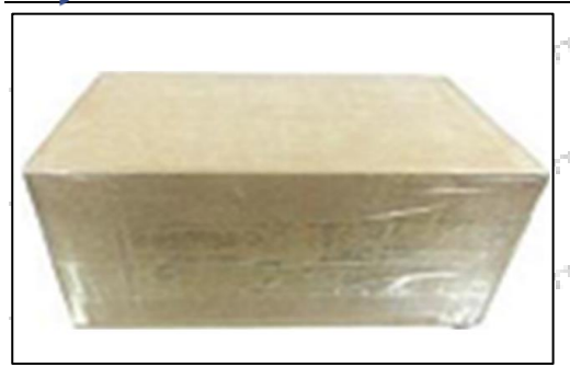
Pic No. 2 Domestic express packaging: Wrapped with Transparent tape